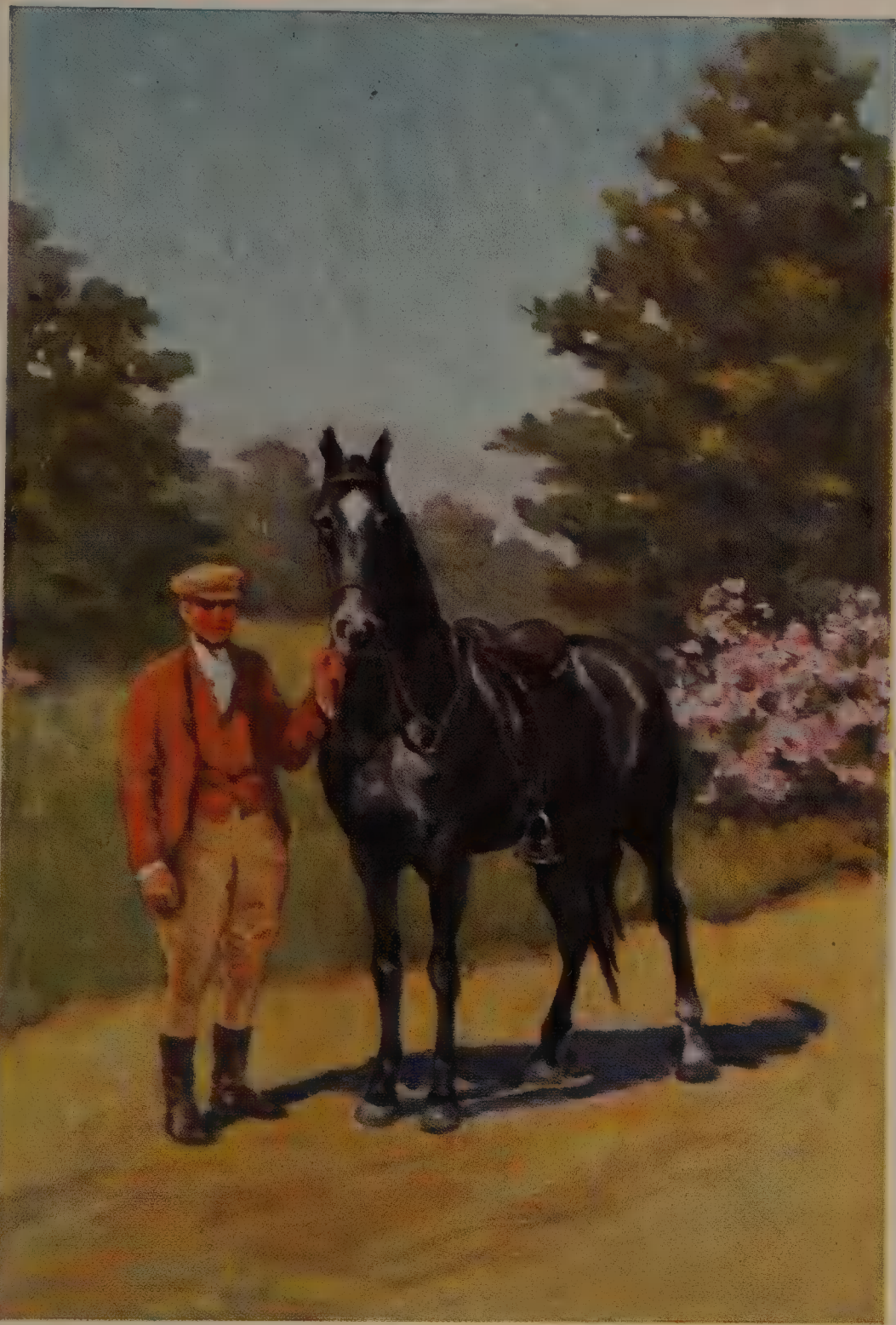
THE NEXT MORNING HE TOOK ME INTO THE YARD